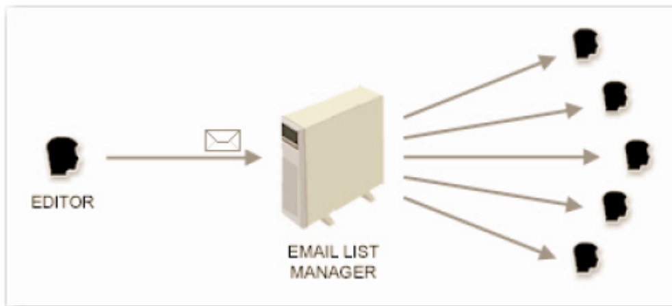
Figure 1: One-Way Distribution/Announcement List

Announcement lists or one-way distribution lists are types of lists where subscribers only receive information and do not interact with other list members. This type of list is most commonly used for delivering news and media publications, company newsletters and any other type of announcement. One-way lists are similar to newspaper subscriptions but cost much less to produce. The quick turnaround time of email allows for faster communication, communication that can be precisely timed and communication that is targeted to those who are truly interested. In addition, spontaneous one-time lists can be created for the occasional message that needs to be distributed to a certain group of people.